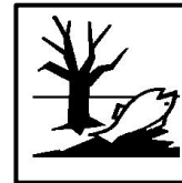
Dangerous for the Environment