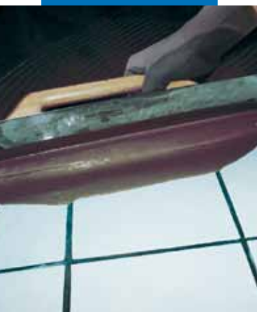
Application of Ultraplan with a metal trowel on an existing ceramic tile floor after the application of Mapeprim SP