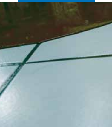
Detail of the application of Ultraplan on an existing ceramic tile floor after the application of Mapeprim SP