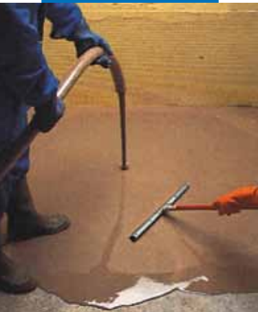
Application of Ultraplan with pump and squeegee

Ultraplan is stable for 12 months stored in a dry place.