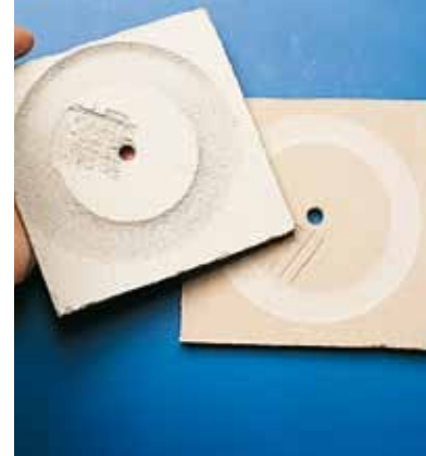
Taber abrasion executed on Ultraplan (right specimen) and on conventional levelling (left specimen) after 200 cycles