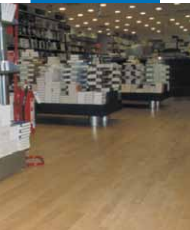
An example of an installation of wood on a surface levelled with Ultraplan - Messagerie Musicali - Rome - Italy