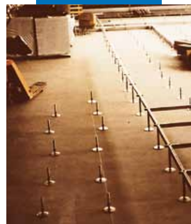
Slab levelled with Ultraplan ready for fixing a floating floor