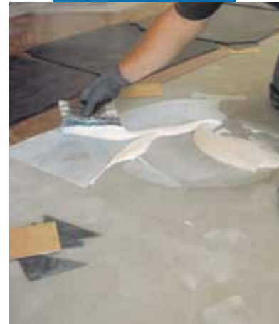
An example of an installation of inlaid PVC on a surface levelled with Ultraplan - CD2 - Milan - Italy