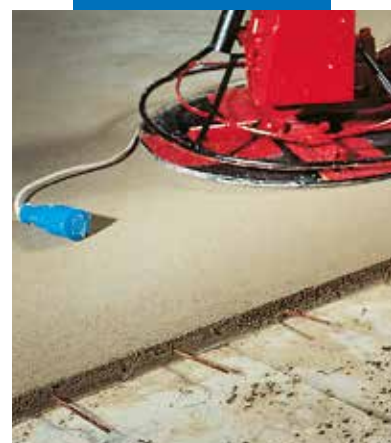
Power floating the surface of a Topcem screed