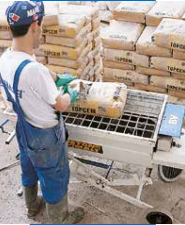
Mixing Topcem in a mini-batcher