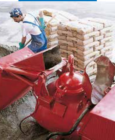
Mixing Topcem with an automatic pumping unit