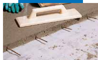
Detail of a Topcem screed with reinforcement rods