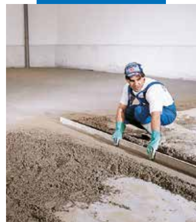
Preparing a levelling strip