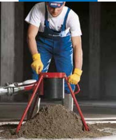
Batching a Topcem mix