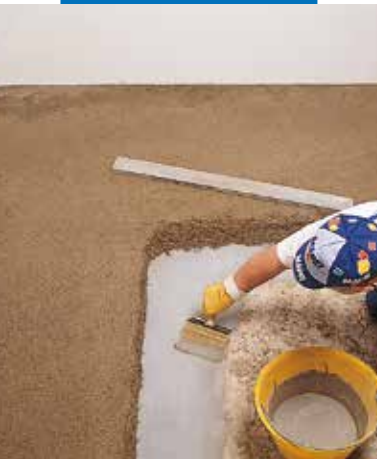
Spreading the anchoring slurry for bonded Topcem screeds