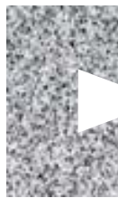
Undercut (Best Cut)